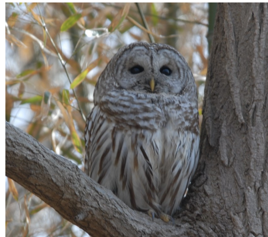
Barred Owl at Read Sanctuary

On a late winter day 15 participants saw 40 species of birds. Some of the highlights were a Barred Owl, three male Wood Ducks, and some Horned Grebes on the sound side at Read. Reported by Doug Bloom.