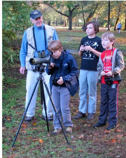
Youth Birders spot a Wood Duck on field trip to Crestwood Lake.

ticipate in our Youth Birding events accompanied by an Adult. Binoculars and Field Guides are available to participants during the walks.