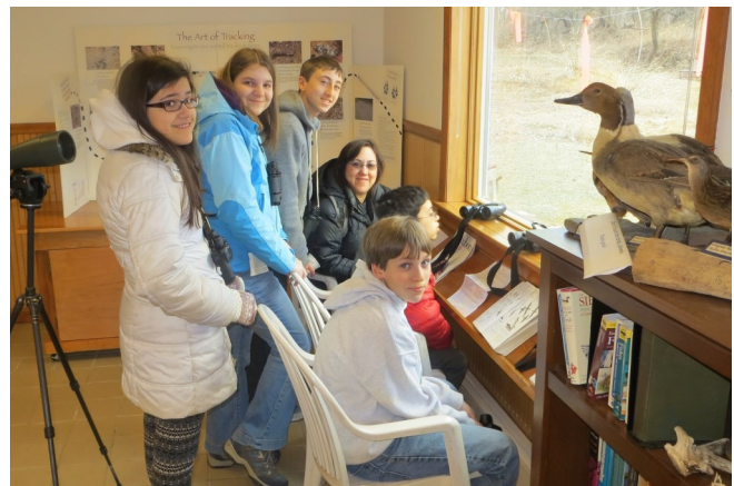
Youth Birders at Read Sanctuary observing feeder birds