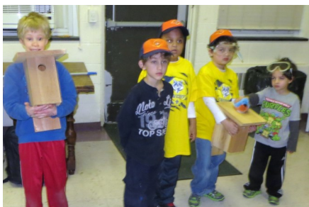
On the left Cub Scouts from Pack 24 in Scarsdale built 2 homes for bluebirds.