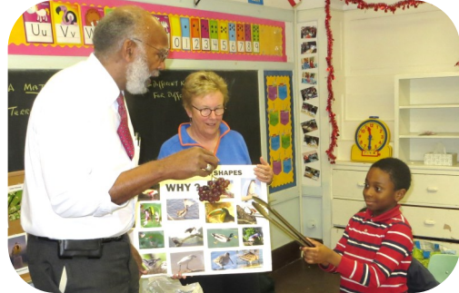
The shape of the beak determines what the bird eats.