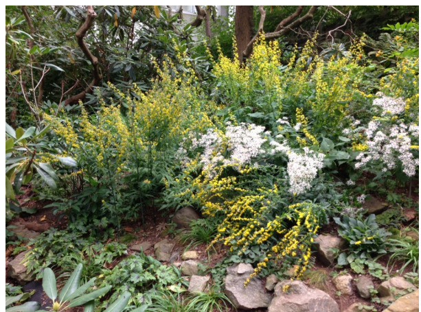
Goldenrods and asters