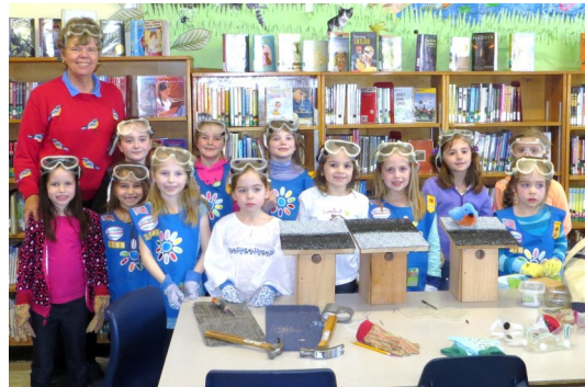
On the left Girl Scout Daisy Troop 1060 from Carmel built 3 nestboxes