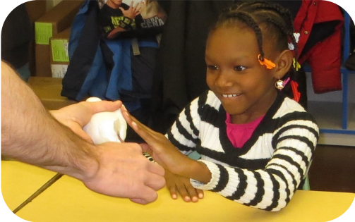
A bird in the hand is worth a million words!