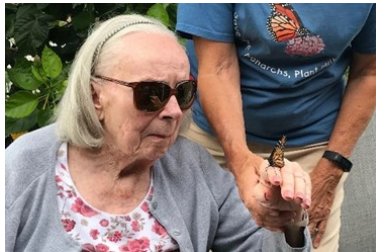
Releasing a newly emerged Monarch butterfly at a follow-up program at King Street Rehab.

I must say, while some residents were noticeably dozing during the presentation, all of them perked up when I went around to each one, showing the caterpillar munching on some milkweed leaves.