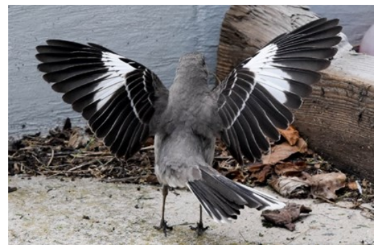
Flashing white wing patches