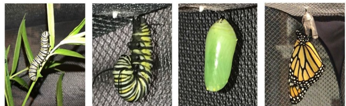
The escaped Monarch went through all these stages during its car ride.

BRSS Audubon has an initiative to promote the planting of milkweed and other native plants to help our butterflies, which in turn are a critical part of the food supply of birds. We are happy to do butterfly programs for other facilities.