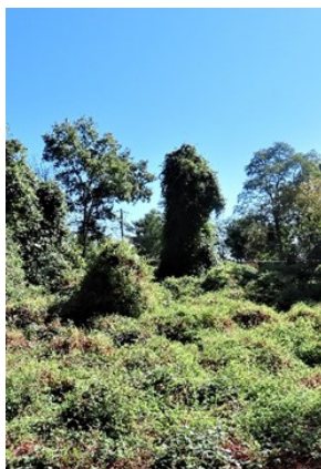
Invasive vines swallowed this tree, but hopes are high for a major restoration of the park.

As time moved forward, people who garden in the park and visit the park have noticed that the meadows and forests within have become overgrown with invasive vines, trees, and herbaceous weeds, outcompeting the native vegetation and limiting the amount of plant and bird life that can and should be within this park. Because of this, a new and exciting set of events have been set in motion.