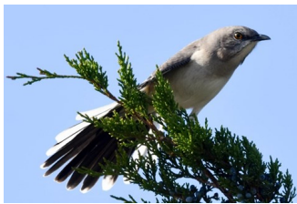
Typical tree-top perch

One of the most distinctive and entertaining members of the Family Mimidae is the Northern Mockingbird ( Mimus polyglottos ). Cousins include the catbirds and thrashers; these birds are known for their beautiful and varied song repertoire, and their ability to mimic other birds and, indeed, many other sounds. The Northern Mockingbird's scientific species name – “polyglottos” – means “many tongues” and is well-deserved. Males are able to sing as many as 200 different song types, many mimicking other birds.