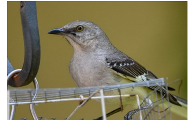
Yellow-eyed Mockingbird at feeder

As Miss Maudie explained to Scout in Harper Lee's To Kill a Mockingbird , “Mockingbirds don't do one thing except make music for us to enjoy. They don't eat up people's gardens, don't nest in corn cribs, they don't do one thing but sing their hearts out for us. That's why it's a sin to kill a mockingbird.” It's hard to argue with that sentiment.